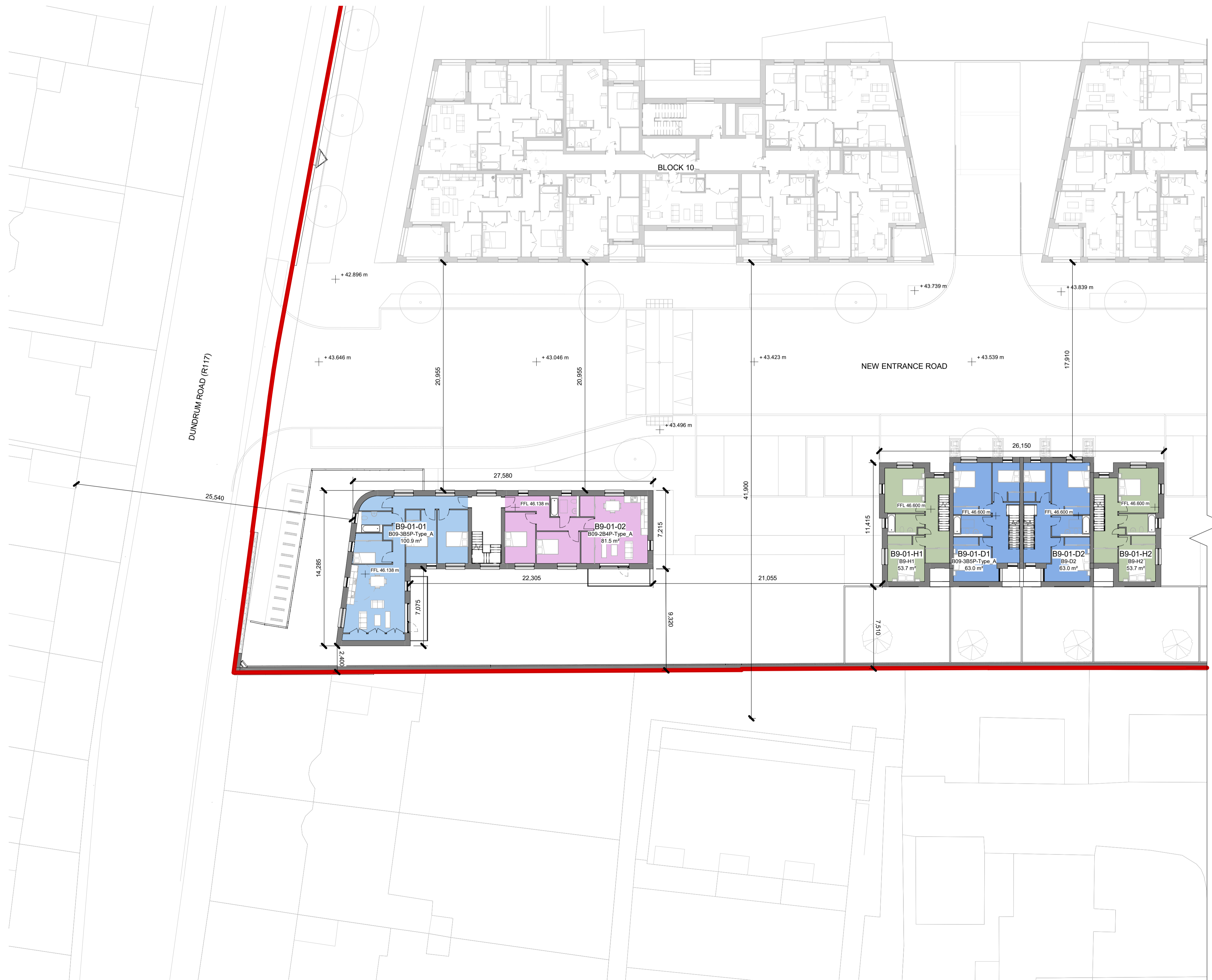
B9_L01 West 1 : 200

Notes: - Do not scale from this drawing. Use figured dimensions in all cases. - Verify dimensions on site and report any discrepancies to the Architect immediately. - This drawing is to be read in conjunction with the Architect's Specification. - © This drawing is copyright and may only be reproduced with the Architect's permission.